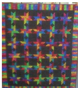
International Mystery Quilts Mexico France Kits Available!