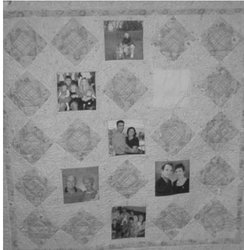
Photo Transfer: Have a special photo you'd like to transfer to fabric? Taking John's class and need your photos printed out? Stop in and we will be happy to do this for you!